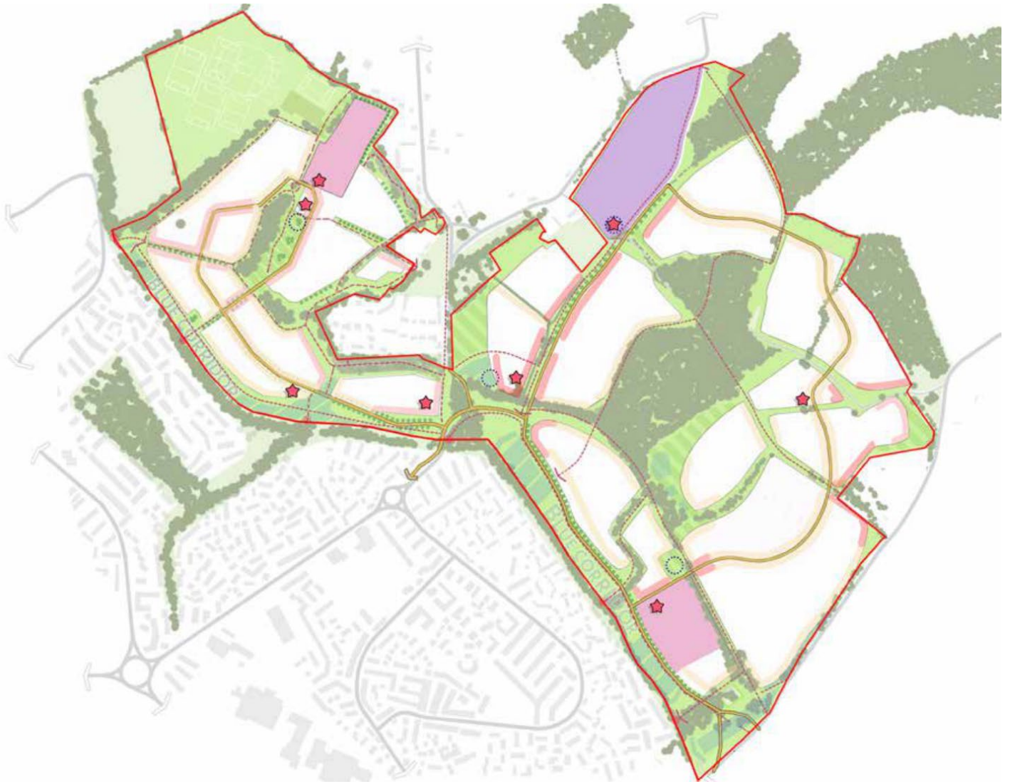
FIG 1. SHOWING NHDC'S APPROVED MASTERPLAN WHICH HAS A VERY LARGE PINK PRIMARY SCHOOL AND ACCESS ROADS PLACED DIRECTLY ON TOP OF EXACT SAME PLACE, WHERE LUTON LPA HAS ALREADY PASSED ITS DCO ROCHDALE ENVELOPE AND ENERGY PIPELINE.

started the work on EIA 17/02300/EIA". So how can NHDC now be considering and approving a large Primary School upon/ within that very same already approved and started Luton DCO and EIA site?